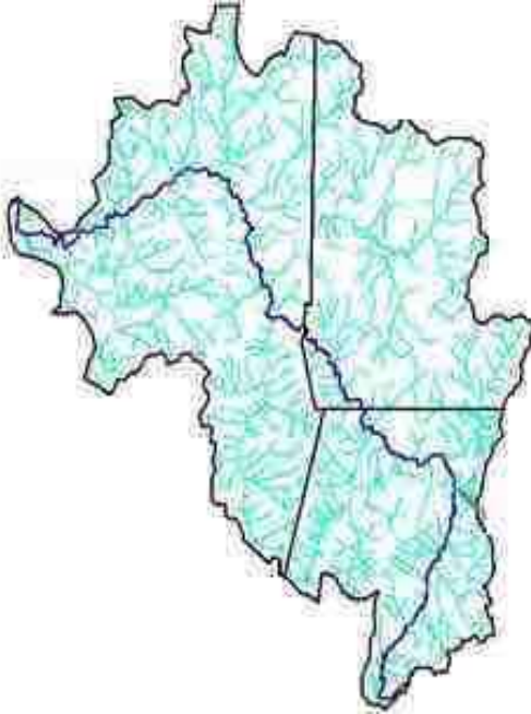
The Hoosic River in New York, Vermont and Massachusetts.