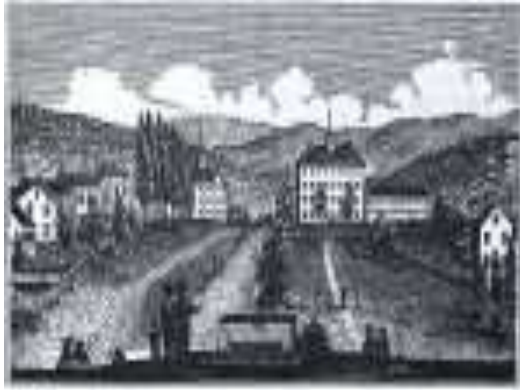
West was the original Williams College building.

chose the 20-mile line, approximately half way between the Hudson and Connecticut rivers, for the New York boundary. Most of Dutch Hoosac ended up in New York State, land claims were adjusted and, incidentally, one of the provisions of Ephraim Williams' will, that the township west of Fort Massachusetts be in the Bay Colony, was fulfilled, enabling the founding of a free elementary school in what became Williamstown. In short order, that school became Williams College.