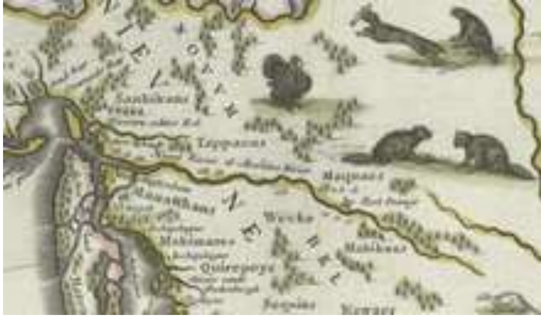
Beaver and other game in the Hudson Valley, Joan Blaeu, Amsterdam, 1635.

By 1613 the fur trade on the Hudson River had grown sufficiently lucrative that the Staten Generaal granted a charter to the United Netherlands Company, a consortium of thirteen Dutch merchants. The Dutch arranged a truce to the fighting, then built Fort Nassau on Castle Island just south of present-day Albany. Prone to flooding, it was abandoned with the outbreak of another Mahican-Mohawk war in 1617. Dutch traders were inclined to favor the Mahican, but they had also ingratiated themselves with the Mohawk by arming them against the Munsee and Susquehannock. This gave the Dutch enough influence to negotiate another truce between the Mohawk and Mahican in 1618. The Dutch then built a new Fort Nassau on higher ground near its former location. The terms of the new agreement gave the Mohawk unlimited access to the Dutch but required them to pay tolls to cross Mahican territory. The Mohawk endured this arrangement for six years.