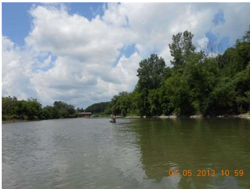
Canoeists approach the Buskirk Bridge.

The cruise established a land base in 1989, leading to an annual Riverfest. Hoosic River Bike Ride, an opportunity to view the watershed in up to three states, began in 2004. These events and other outings have enabled HooRWA to introduce the river to thousands who may not have known it was there; and to relate the river to outdoor enjoyment. HooRWA has also worked in the schools to foster river-based learning.