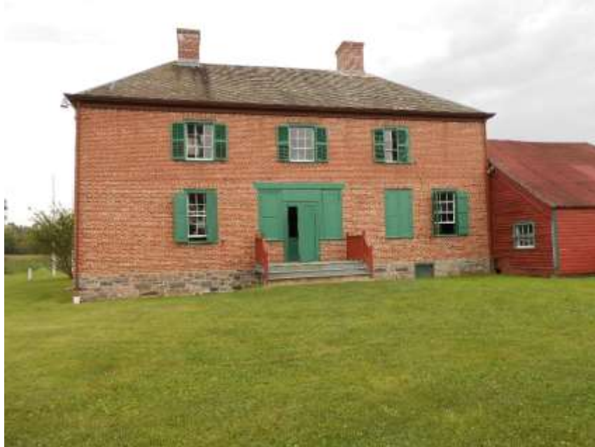
The c. 1788 Knickerbocker Mansion as rehabilitated in Schaghticoke.