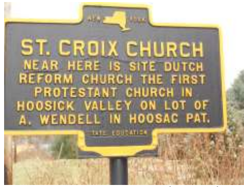
Near White Creek, as well, 17 th and 18 th century forts.