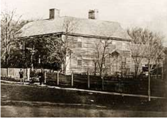
The former Catamount Tavern, Bennington, in a 19 th century photo.

and hoisted high in a chair to sit for hours before and above the Catamount Tavern, the favorite Green Mountain Boy meeting place in Bennington.