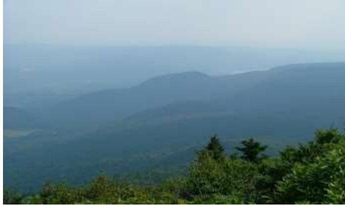
The upper Hoosac Valley.

The uplands that comprise the Hoosic watershed are part of the Appalachians, a mountain chain once of Himalayan proportions that formed millions of years ago when continental plates collided. This Taconic Orogeny (mountain building) caused offshore islands to be pushed west into what is now New England, which is why area mountains contain layers of rock formed under the ocean, such as quartzite, schist, and limestone. Wind and water erosion through time have reduced and continue to reduce their height.