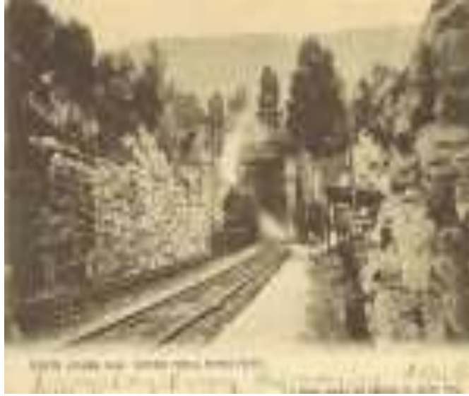
The Hoosac Tunnel.

Settlers needed wood to build their homes and outbuildings; they burned 20 cords or more annually to cook their food and warm their hearths. They cleared for crops, for sunlight, and to provide separation from whatever people or animals were lurking in the forest. They began the job of denuding the landscape. As the farms moved upslope, away from the alluvial land, they cut farther toward the ridgelines. Then their livestock, notably the sheep, summited, denuding the vegetation and allowing erosion. Manufacturing needed wood, too, especially as converted to charcoal for smelting iron. Charcoal burners combed the hillsides, hauling their product to the furnaces. Lime burning similarly ate trees. The demands of railroads—early on—for fuel and all along for poles, crossties, and buildings, finished the job of deforestation. The hillsides leaked into the rivers, covering the gravel and sand with silt.