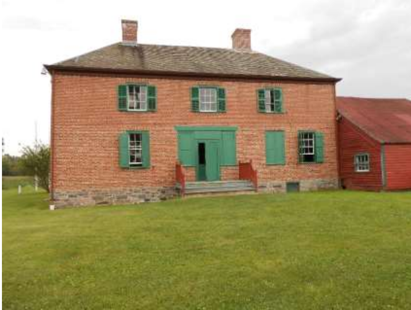
The c. 1788 Knickerbocker Mansion as rehabilitated in Schaghticoke.