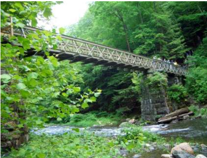
The Mahican Mohawk Trail crosses South River on old railroad abutments.