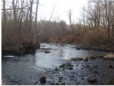
The Walloomsac forms in these wetlands.

southeast to northwest riverbed. Traces of the lake are still visible as gravel and sand beaches, hundreds of feet above the river valley in northwestern Massachusetts and southern Vermont. A tributary, the Green River, is greenish because finely powdered rock left over from glacial rock grinding is still washing down from the hills.