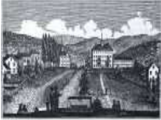
West was the original Williams College building.

chose the 20-mile line, approximately half way between the Hudson and Connecticut rivers, for the New York boundary. Most of Dutch Hoosac ended up in New York State, land claims were adjusted and, incidentally, one of the provisions of Ephraim Williams' will, that the township west of Fort Massachusetts be in the Bay Colony, was fulfilled, enabling the founding of a free elementary school in what became Williamstown. In short order, that school became Williams College.