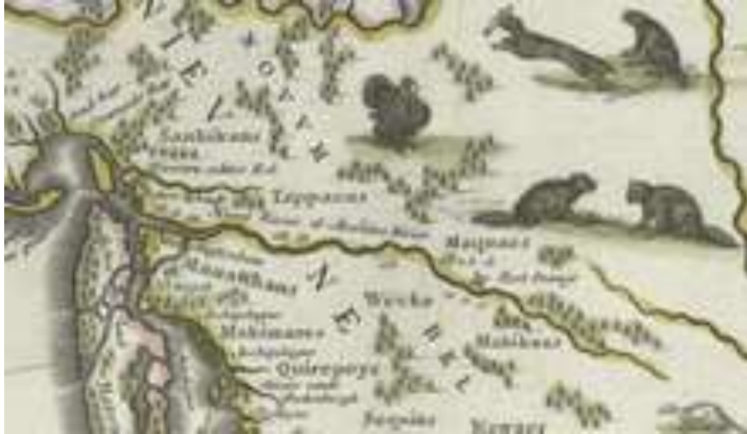
Beaver and other game in the Hudson Valley, Joan Blaeu, Amsterdam, 1635.

By 1613 the fur trade on the Hudson River had grown sufficiently lucrative that the Staten Generaal granted a charter to the United Netherlands Company, a consortium of thirteen Dutch merchants. The Dutch arranged a truce to the fighting, then built Fort Nassau on Castle Island just south of present-day Albany. Prone to flooding, it was abandoned with the outbreak of another Mahican-Mohawk war in 1617. Dutch traders were inclined to favor the Mahican, but they had also ingratiated themselves with the Mohawk by arming them against the Munsee and Susquehannock. This gave the Dutch enough influence to negotiate another truce between the Mohawk and Mahican in 1618. The Dutch then built a new Fort Nassau on higher ground near its former location. The terms of the new agreement gave the Mohawk unlimited access to the Dutch but required them to pay tolls to cross Mahican territory. The Mohawk endured this arrangement for six years.