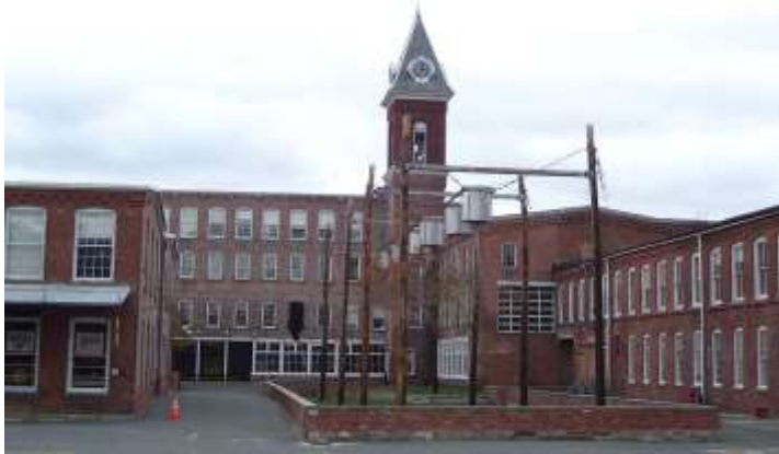
Mass MoCA.