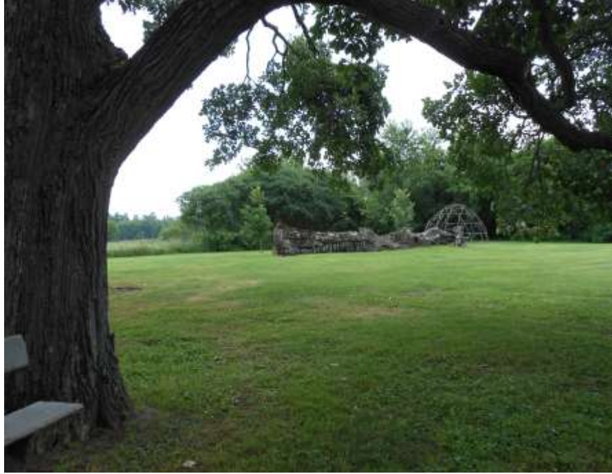
The remains of the Witenagemot Oak rest behind the Knickerbocher Mansion.