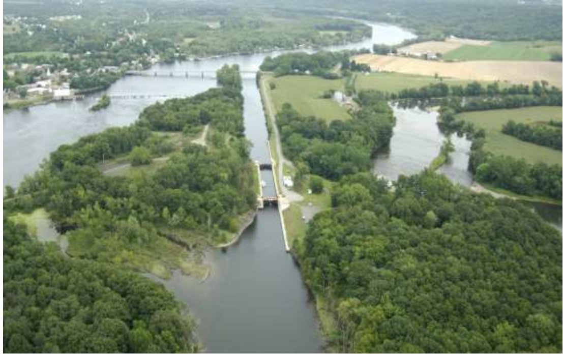
The Hoosic River, right, enters the Hudson via Lock 4, Champlain Canal.

Champlain Barge Canal, only closed to commercial traffic in the 1980s and still available for recreational use. The Hoosic enters the Hudson at Lock Four, Schaghticoke, in the largest park (91 acres) in New York State's canal system. Construction included removing high, shale bluffs, and reconfiguring two islands to become part of the shore, along with two dams, a bridge, and the canal cut.