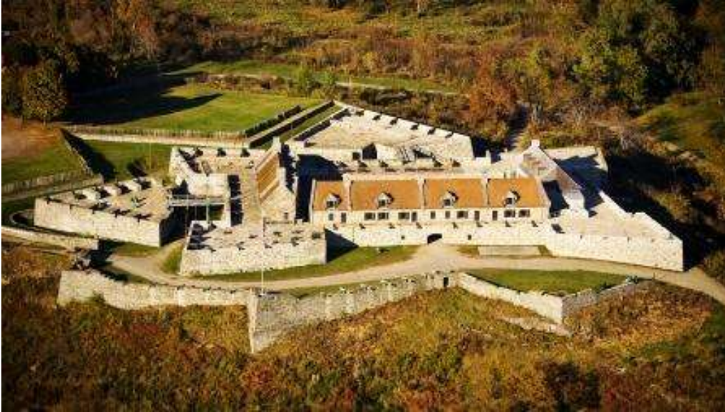
Fort Ticonderoga as it appears today.

As independence from Britain became a theme in the colonies, Fort Ticonderoga seemed a likely early target. Held by the British, it was a starting point for any attack south from Canada; held by the colonists, it might prevent the same. Colonists dropped by the fort, noting that the British held it rather casually. Benedict Arnold received a commission from the Bay State, hustling across the old “Mohawk” trail along the Deerfield and Hoosic rivers.