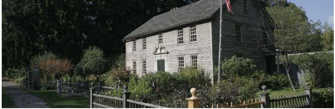
Sargeant's c.1742 Mission House, Stockbridge.

Meanwhile Mahicans from Stockbridge had been providing invaluable military service in the defense of British settlements. They garrisoned Fort Dummer (Vermont) to protect settlements in western New England against Abenaki raids during Grey Lock's War (1724-27). They also served as British scouts during the King George's War (1744-48), but their white neighbors grew increasingly hostile. Turning the other cheek as required by their new faith, the Stockbridge chose to not to retaliate for the unprovoked murder of a Mahican in 1753 by two whites, even when their punishment by a Massachusetts court was exceptionally lenient. At the outbreak of the French and Indian War in 1755, a war party from St. Francis came to Schaghticoke in August and took its people back to Canada with them. The defection of the Schaghticoke made the British suspect the loyalty of all of their native allies. Distrust increased when some of the Schaghticoke returned and killed five colonists near Stockbridge. Yet 45 Stockbridge warriors joined Major Robert Roger's Rangers in 1756. Because of them, Abenaki and Schaghticoke raiders avoided English settlements along the Housatonic. Rather than receiving gratitude, the Stockbridge found themselves increasingly unwelcome in New England.