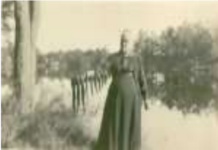
Lucy Bridges Prindle caught Hoosic trout in the late 19 th century. Will we always be able to?

recent studies Manomet reviews have emphasized that conditions for trout need to be assessed on a site-by-site rather than regional basis. The relationship between air temperature and water temperature is not automatic. Other factors may buffer stream temperatures, such as tributaries flowing from the hillsides, the addition of groundwater, stream shading, angle to the sun, and adjacent land use. Blacktopped parking lots and roads by rivers; dams; concrete or stone walls, all increase heat.