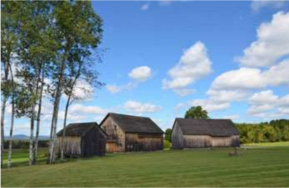
Historic barns at Nipmoose.

Farmers were eventually crowded out of the bottomlands necessary to sustain wheat crops and moved to the higher lands on the valley walls. There, although they disassembled their barns and took them with them, they were forced to change their focus to grazing animals, which they could raise when the soil was not as good. In fact, even those who stayed beside the rivers eventually exhausted the soil for wheat. Most farmers in the Hoosac Valley changed from wheat to dairy or sheep soon after the Revolutionary War. Then they grew corn and hay to feed their animals. So now the farmers had barns originally designed for wheat storage they were using to house animals—and, as time wore on, the barns became less and less relevant to the farmer's occupation, with 20 th century regulations for sanitary milk production being the final blow. Wooden barns, the emblem of European farming, started some 250 years ago the long decline still evident on today's Hoosic landscape. Most agriculture continues to decline, as well. Yet, as some farmers plow to the river edge, they continue to release soil into the water.