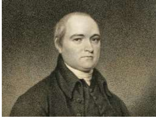
Timothy Dwight, IV

Monday, October 14 th , [1799] we left Hoosick and rode to Williamstown, in Massachusetts, sixteen miles. Our journey was in the valley of the Hoosic River, and was uncommonly romantic and delightful.