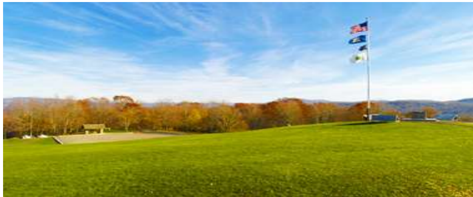
Bennington Battlefield.