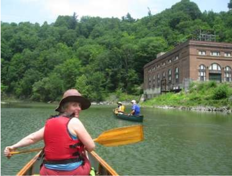
Putting in below the powerhouse at Schaghticoke.

facility until selling it to Brascan, which became Brookfield Power. When one of the penstocks burst, flooding the powerhouse, Brookfield sold the facility to Orion Power, which completed major replacement of penstocks and surge tank in 2000. All of the dams disrupted fish passage and warmed the water.