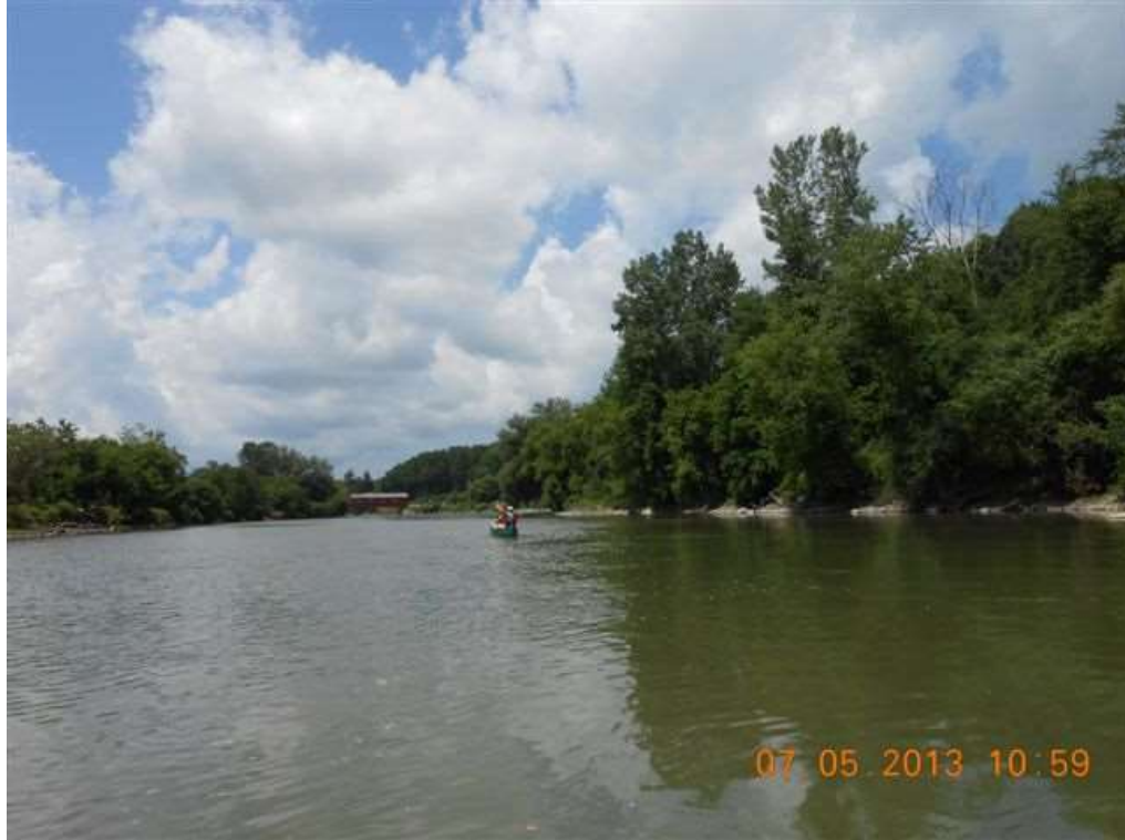
Canoeists approach the Buskirk Bridge.

The cruise established a land base in 1989, leading to an annual Riverfest. Hoosic River Bike Ride, an opportunity to view the watershed in up to three states, began in 2004. These events and other outings have enabled HooRWA to introduce the river to thousands who may not have known it was there; and to relate the river to outdoor enjoyment. HooRWA has also worked in the schools to foster river-based learning.