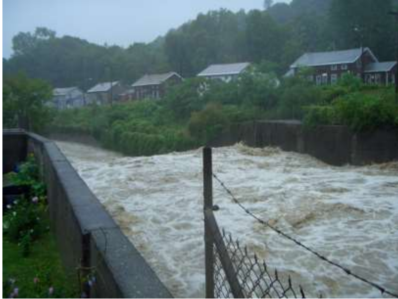
Tropical Storm Irene, Aug. 28, 2011, provided the first test for the North Adams chutes.

While the states and the federal government had taken some action previously, Congressional passage the Clean Water Act in 1972, offering funding for sewage treatment and penalties for dumping, began substantial improvement of water quality. In the Hoosac Valley, it was not a case that residents rose up demanding a cleaner river; they had come to accept the notion that having jobs required mistreating natural resources. Rather government action led to a gradual change in residents' attitudes towards their rivers from utilitarian to more recreational, aesthetic, and health conscious. Families remembered foul smells and flooding, but gradually many came to realize that a cleaner river could improve living conditions and could expand the economy.