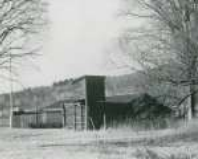
Photo of a 1930s reproduction of Fort Massachusetts.