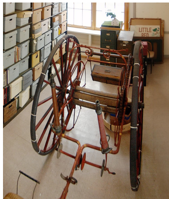
Gale Hose No. 2 in the Collections Room at the South Center School

Research suggests the JB Gale No. 2 likely was donated to Mount Hope Farm after the early Gale Hose Company and Williamstown Fire District turned to motorized vehicles beginning in 1916. By the Roaring Twenties, Mount Hope had in place a private fire hydrant loop, and the hose cart was likely a welcome addition in case of fire. Evidently, the cart was used rarely, if ever, in service at Mount Hope, as available records do not document large fires in the vicinity of Mount Hope since it was built in 1928.