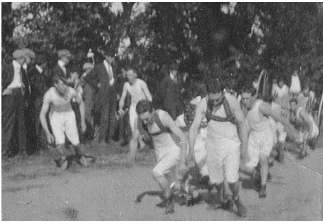
Firemen train with No. 2

Fire District, organized in 1912, has gradually come to assume responsibility for most fire protection in town (the Forest Warden maintains jurisdiction over outdoor fires), and the Gale Hose Company has assumed the role of a fraternal organization of Williamstown fire-fighters, with a mission including service to current and former fire-fighters, their fam-