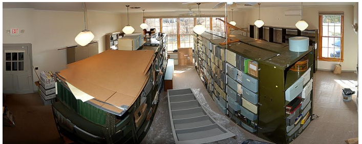
We're getting there!