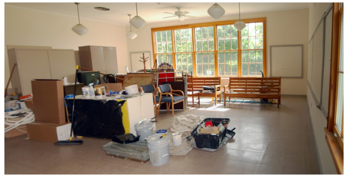
Above: before shelving was installed Below: panoramic view of installed shelves