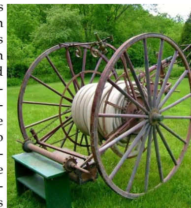
Gale Hose Cart