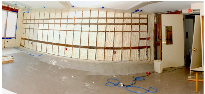
Above: walls with spray foam before drywall and partial walls were constructed