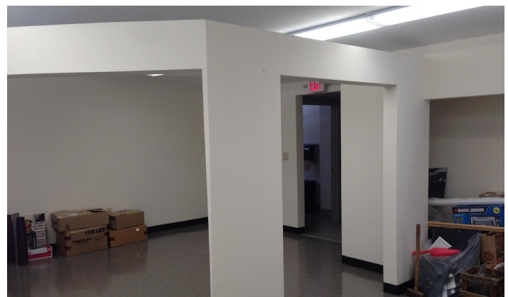
Progress is being made!